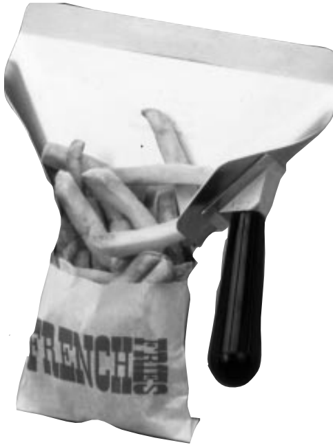
Model 152-ARN (Right-Handed)