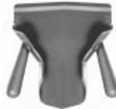
Model 252-DH (Dual-Handed)