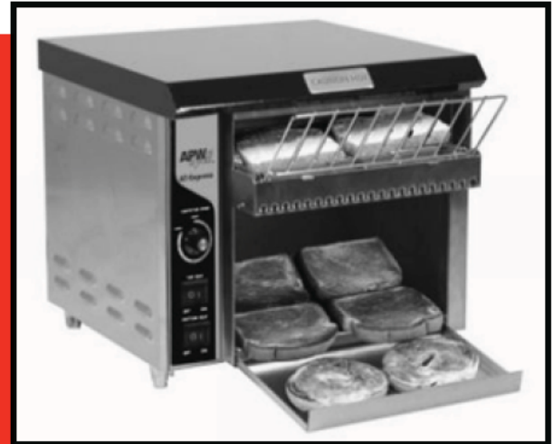
AT EXPRESS RADIANT CONVEYOR TOASTER