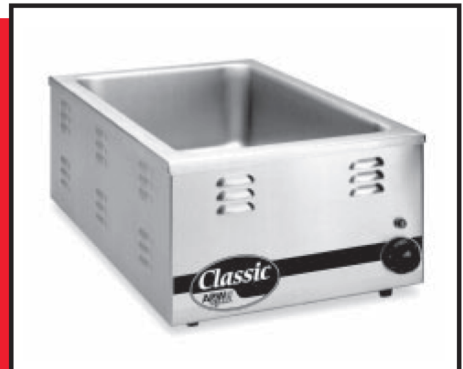
MODEL W-3V COUNTERTOP WARMER