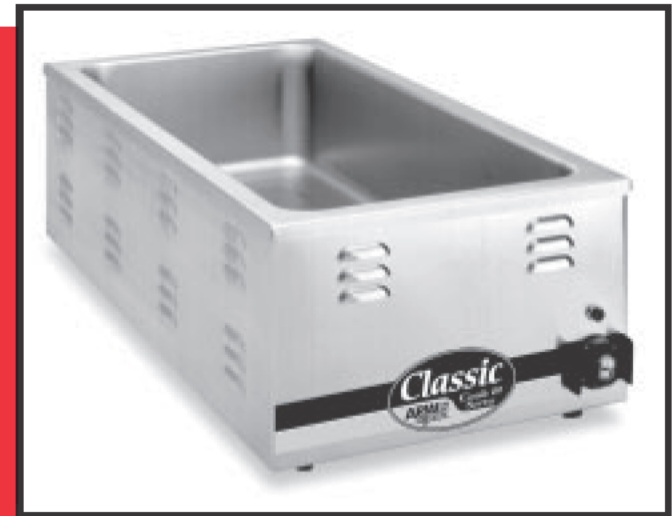
MODEL CW-3A COUNTERTOP COOKER