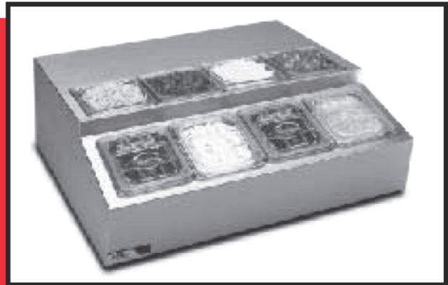
MODEL RTR-8 Refrigerated Topping Rail

New Smaller model for tight counter space! Refrigerated countertop system that keeps everything at NSF safe temperatures. Holds 4 pans 1/6th size by 6" deep. Each pan has its own hinged, removable cover. All pans are completely removable for easy cleaning. All stainless steel construction and 1/2" nonadjustable legs. Cold wall refrigeration system utilizing a 1/6 HP compressor.