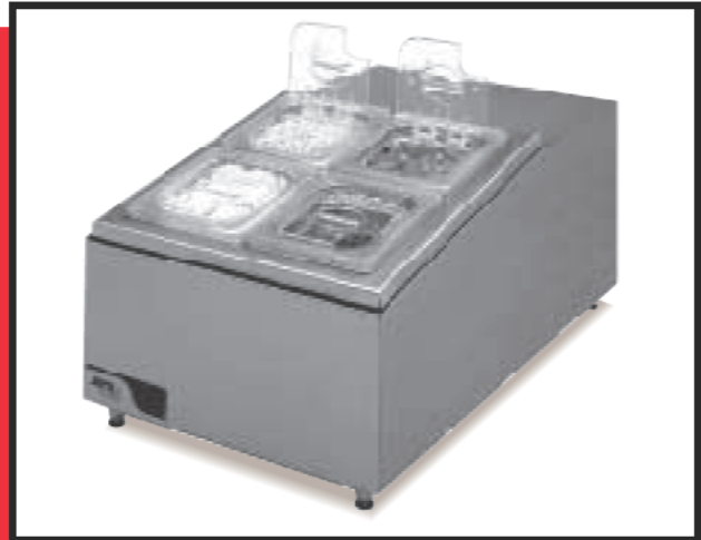
MODEL RTR-4 Refrigerated Topping Rail