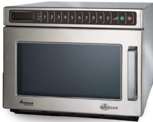
Model HDC12A2 shown