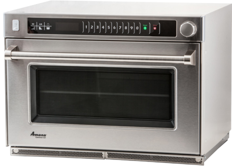
Model AMSO22 shown