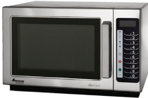
Model RCS10TS shown