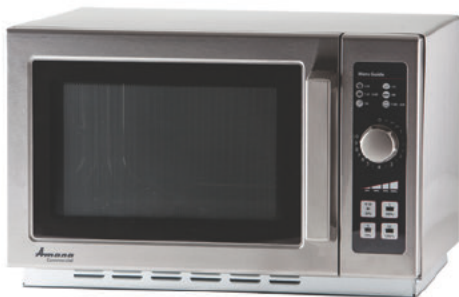
Model RCS10DSE shown