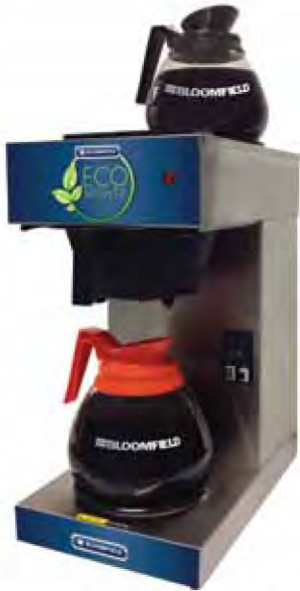
Model 4543-D2 (decanters sold separately)