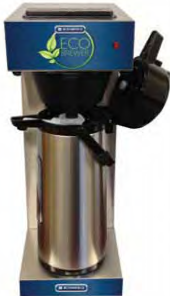
Model 4774-A (Airpot sold separately)

ENERGY SAVINGS OF UP TO 20%* OVER TRADITIONAL "DINK" STYLE UNITS. *The quote doesn't include the decanters