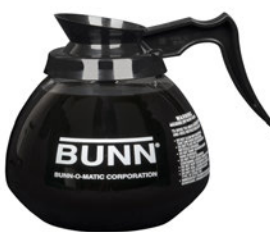
DECANTER, GLASS-BLK 12C 3/CS