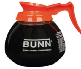
DECANTER, GLASS-ORN 12C 3/CS