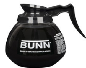
DECANTER, GLASS-BLK 12CUP 1PK