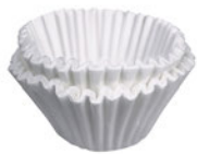
FILTERS,REGULAR1M 500/2 50/CL