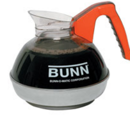
EASY POUR,(ORN) 2/CS