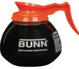
DECANTER, GLASS-ORN 12C 24/CS