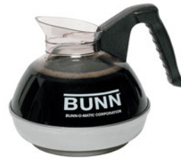
EASY POUR,(BLK) 6/CS