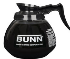
DECANTER, GLASS-BLK 12C 24/CS