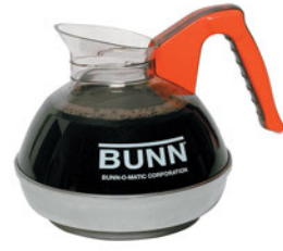
EASY POUR,(ORN) 6/CS