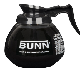
DECANTER, GLASS-BLK 12C 24/CS