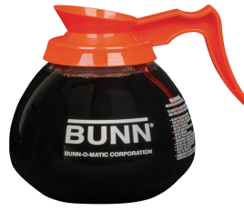
DECANTER, GLASS-ORN 12 CUP 1PK