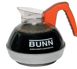
EASY POUR,(ORN) 2/CS