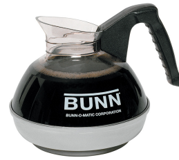
EASY POUR,(BLK) 6/CS