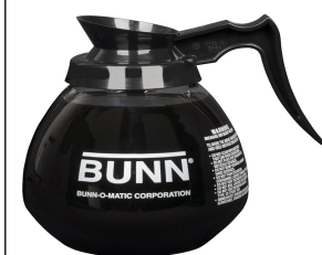
DECANTER, GLASS-BLK 12CUP 1PK