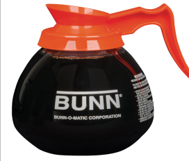
DECANTER, GLASS-ORN 12C 3/CS