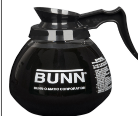
DECANTER, GLASS-BLK 12C 24/CS