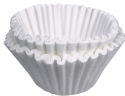
FILTERS.REGULAR1M 500/2 50/CL