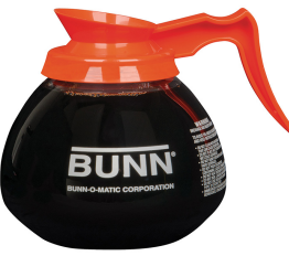
DECANTER, GLASS-ORN 12C 24/CS