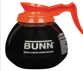
DECANTER, GLASS-ORN 12C 3/CS