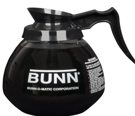
DECANTER, GLASS-BLK 12C 3/CS