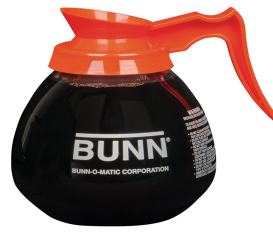
DECANTER, GLASS-ORN 12C 24/CS