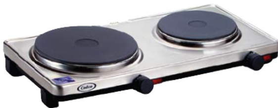
DKR-S2: Double Cast Iron Hot Plate 7-3/8" element / 1000W; 6" element / 600W / 120V