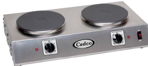
CDR-2C Double Cast Iron Hot Plate 7-1/2" cast iron elements 900W/burner / 1,800W total / 120V