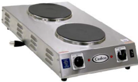
CDR-2CFB Double Cast Iron Space Saver Hot Plate Space saving front-to-back design 7-1/2" cast iron elements 900W/burner / 1,800W total / 120V