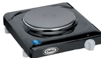
KR-1: Cast Iron Hot Plate (Same as KR-S2, except Black Enamel Finish)