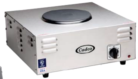
CSR-1CH Hi-power Single Cast Iron Hot Plate 7-1/2" cast iron element 1500W / 120V

All Models: ● Cast Iron Elements ● Heavy Duty Stainless Construction