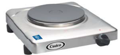
KR-S2: Cast Iron Hot Plate 7-1/8" element / 1500W / 120V