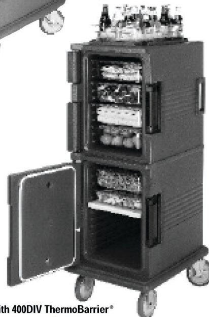
UPC800 (Shown with 400DIV ThermoBarrier® in bottom compartment)