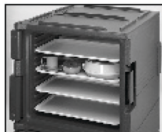
Gastronorm sizing accommodates 4 each GN 1/1 (Product #3253) fully loaded Metric Camtrays in each compartment.