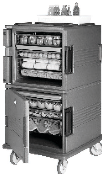
UPC1600 (Shown with 1600DIV ThermoBarrier® in top compartment and CP1220 Camchiller® in bottom compartment)