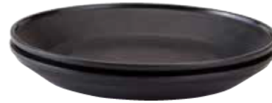
Stackable Camchiller Pellets