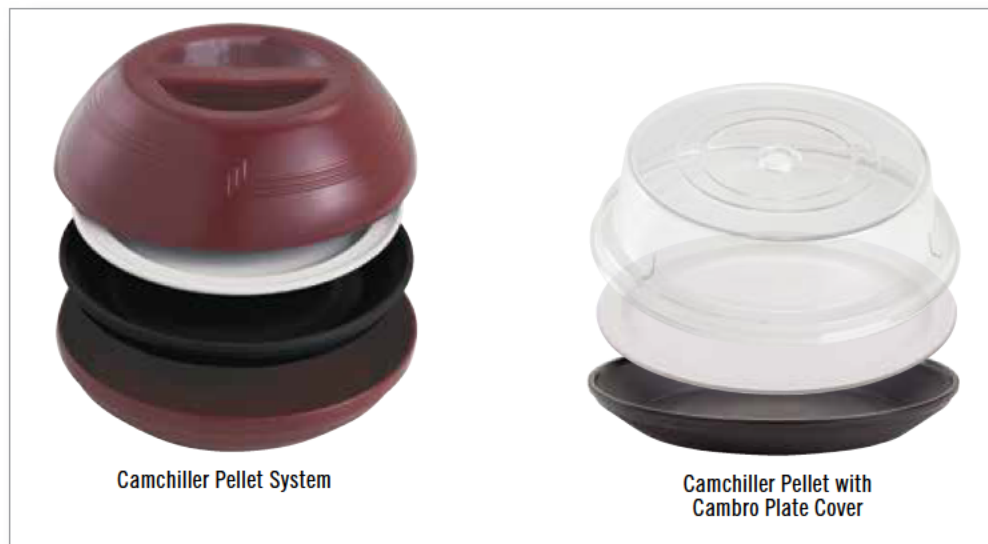
Camchiller Pellet System