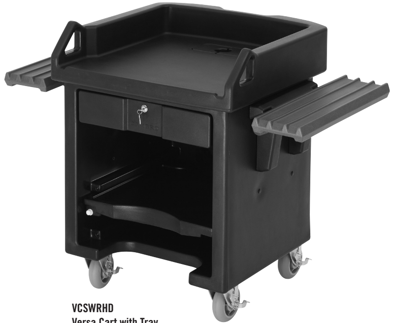
VCSWRHD Versa Cart with Tray Rails shown with optional heavy-duty casters.