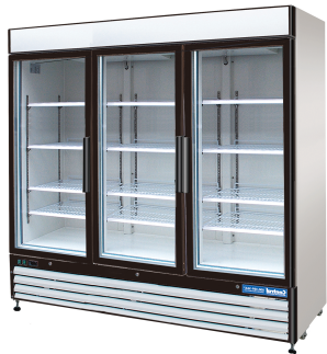
69K-828HC (Doors: Sliding)