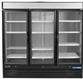
69K-811HC (Color: Black)