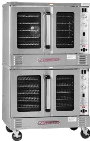
SLGS/22SC shown with optional casters

OPTIONAL NRG System required for rebates. NRG System units are Energy Star Approved. (Standard Depth Only)