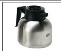
CLXP6401S000 64 oz. Stainless Steel Pourpot