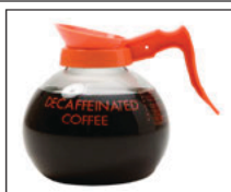
70280200406 64 oz. Glass Decanter - Decaf