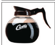
7028000306 64 oz. Glass Decanter - Regular