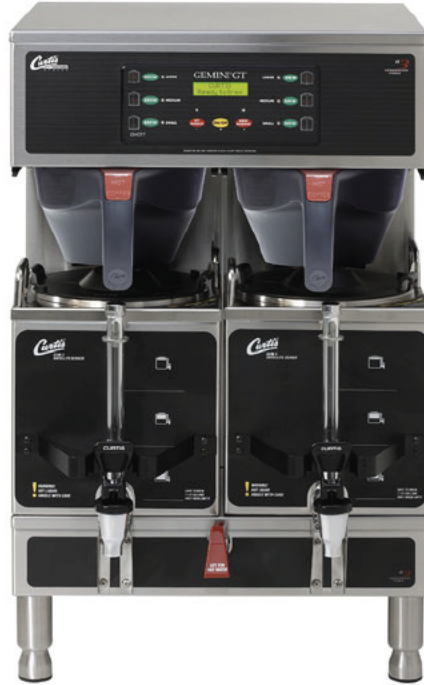
GEMTS10A1000/ GEMTS16A1000/ GEMTS19A1000 Twin Coffee Brewer with Two GEM-3 1.5 Gallon Satellite Servers