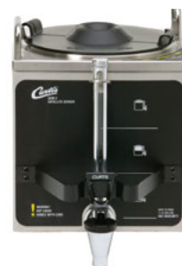
GEM-3 1.5 Gallon Satellite Server