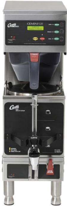
GEMSS10A1000/ GEMSS63A1000 Single Coffee Brewer with One GEM-3 1.5 Gallon Satellite Server

MODEL : GEMSS10A1000, GEMSS63A1000, GEMTS10A1000, GEMTS16A1000, GEMTS19A1000