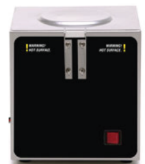
GEM-5 Satellite Warmer Stand