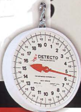
DETECTO model MCS-40P dial scale with galvanized scoop

The MCS series is an economical mechanical scale for estimate weighing and never requires any power.