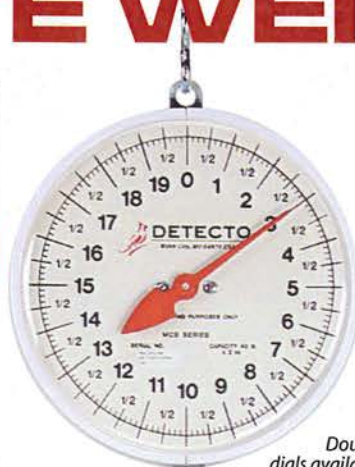
Double dials available on some models for viewing from either side of the scale.