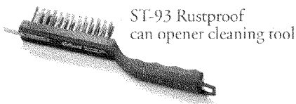
ST-93 Rustproof can opener cleaning tool

The U-12 is easily disassembled for increased sanitation