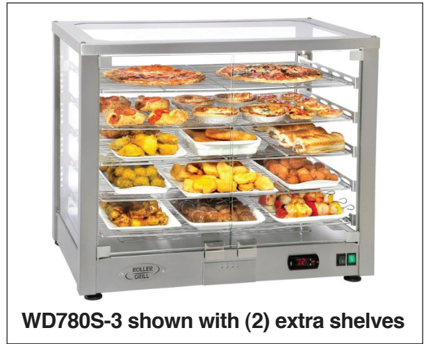
WD780S-3 shown with (2) extra shelves

765 WESTMINSTER STREET PROVIDENCE, RI 02903 TEL: (401)273-3300 FAX: (401) 273-3328 E-mail: sales@equipex.com www.equipex.com