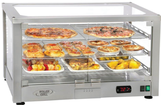
Shown with stainless steel exterior