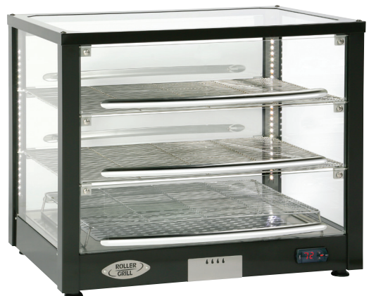
Shown with black exterior