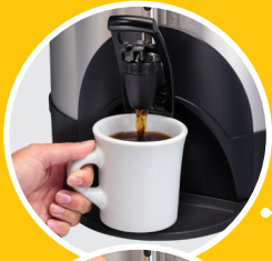
Unique, One-Hand Pour Tap Press to pour into hard cups, or pull to pour into soft cups