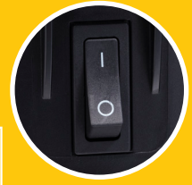
On/Off Switch Located on back of unit

All commercial urns share the same features except for tank size