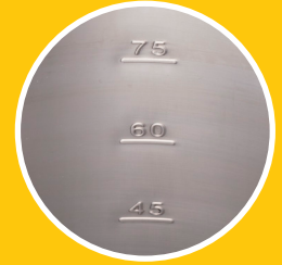
Embossed Level Marks Inside the Urn For exact measuring of coffee