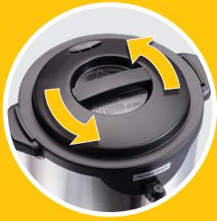
Convenient Locking Lid A quick twist locks lid in place