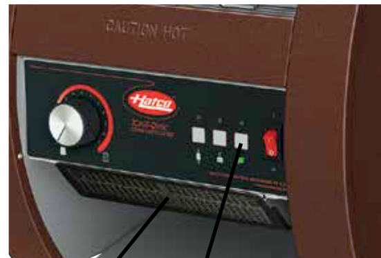
Air Intake Filter Screen