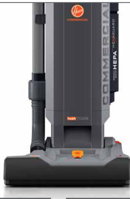
CH54015 HUSHTONE™ 15