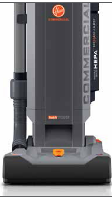
CH54013 HUSHTONE™ 13