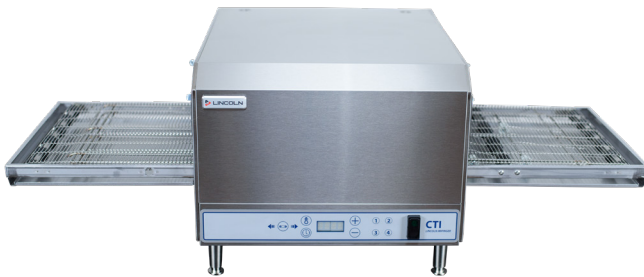
Shown with 50" (1270 mm) extended conveyor