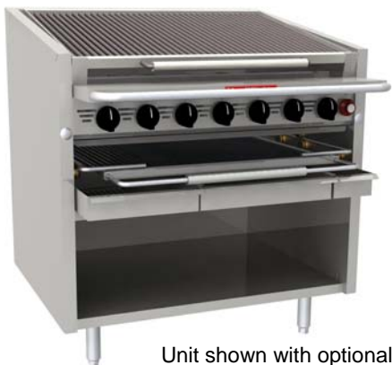
Unit shown with optional lower rack