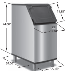
D420 310 lbs. (141 kgs) (Available January)