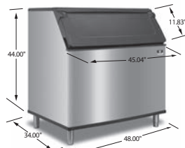
D970 710 lbs. (323 kgs)