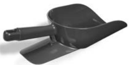
Ergonomic NSF approved sanitary ice scoop included