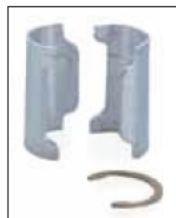
Aluminum Split Sleeves

Bag of four aluminum sleeves with C-rings.