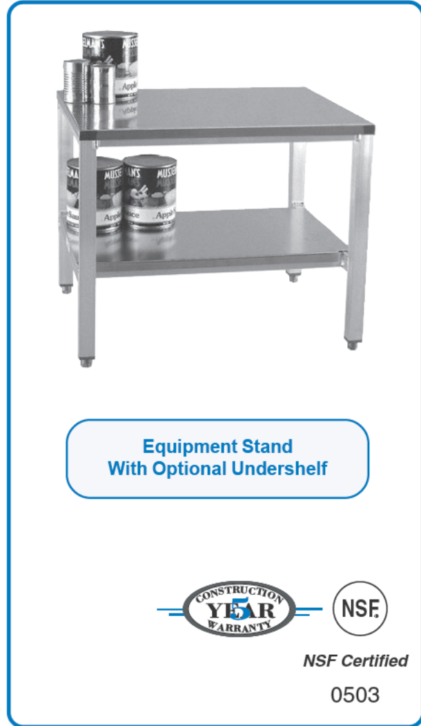
Equipment Stand With Optional Undershelf

Like all of our products, the equipment stand is built to last... We Guarantee It! Each unit carries a Lifetime Guarantee against rust and corrosion as well as a Five-Year Guarantee against material defects and workmanship.