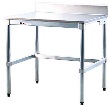
Stainless Steel Top With Backsplash