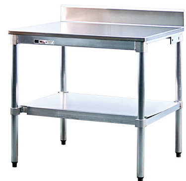
Stainless Steel Top w/ Backsplash & Undershelf

This information is for general sales and engineering use only. New Age Industrial reserves the right to modify or make changes at any time without notice to materials and specifications.