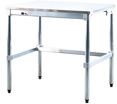
Solid Stainless Steel Top