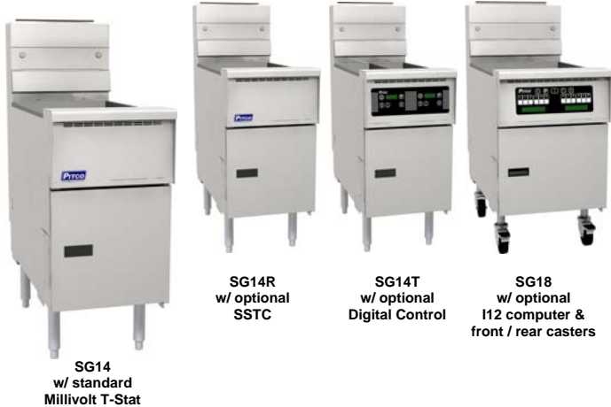
SG14 w/ standard Millivolt T-Stat

For High Production Gas frying specify Pitco Solstice Gas Models SG14, 14R, 14T or SG18 tube fryers with the patented Solstice Burner Technology. The dependable blower free atmospheric heating system provides fast recovery to cook a variety of food products. The Solstice gas fryer comes standard with a millivolt thermostat, for melt cycle and boil mode choose the optional quick responding solid state thermostat with the matchless ignition system. The optional digital control and the elastic time computer are available and can be used with our optional labor saving highly reliable basket lift system. The patented self cleaning burner and down draft protection keeps your fryer tuned up for peak daily performance.