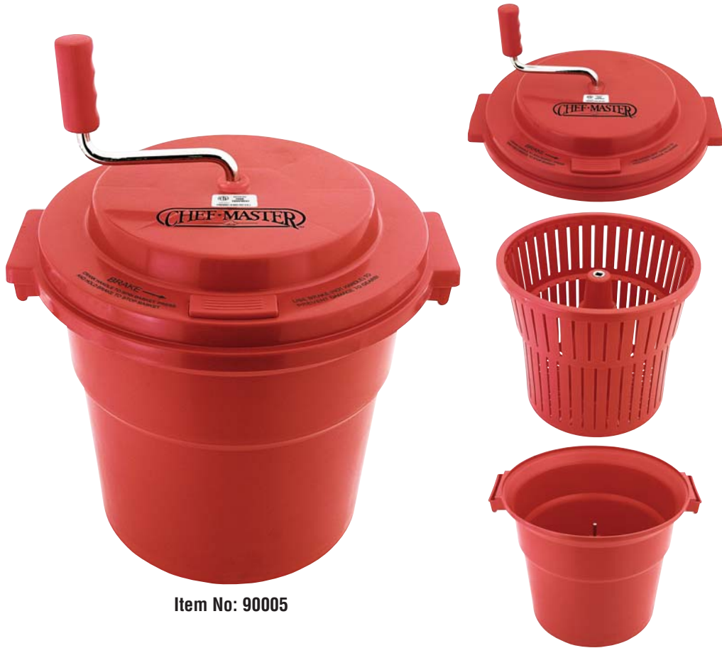
Item No: 90005