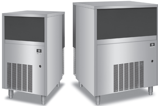
Model RNS-0244A Nugget Ice Machine