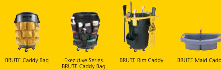
BRUTE Caddy Bag Executive Series BRUTE Caddy Bag BRUTE Rim Caddy BRUTE Maid Caddy