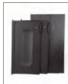
9T85 Locking Cabinet Door Kit

Dim 33" l x 16" w x 1" h Ship Wt 16 lbs Color BLA Pack 1