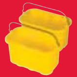
10 Quart Disinfecting Caddies