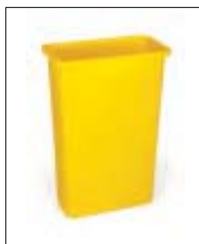
3540 Slim Jim® Waste Container

Dim 12 \frac{1}{2} " l x 3" w x \frac{1}{8} " h Ship Wt 3.5 lbs Color 0000 Pack 1 set