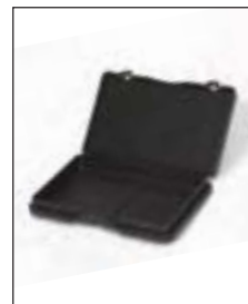
6179 Waste Cover & Storage Compartment

Dim 28" l x 19 \frac{3}{4} " w x 1 \frac{1}{2} " h Ship Wt 7.3 lbs Color BLA Pack 6