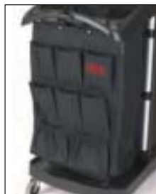
9T90 9-Pocket Fabric Organizer

Dim 11" l x 17 \frac{1}{2} " w x 14" h Ship Wt 7 lbs Color YEL Pack 2