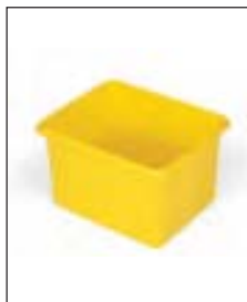
9T84 30 Quart Storage Bin

Dim 7 \frac{1}{2} " l x 9 \frac{1}{2} " w x 8 \frac{1}{2} " h Ship Wt 6 lbs Color BLUE, GRN, RED, YEL Pack 4 (1 ea color)