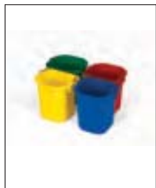
9T83 5 Quart Disinfecting Pails

Dim 7 \frac{1}{2} " l x 9 \frac{1}{2} " w x 8 \frac{1}{2} " h Ship Wt 6 lbs Color BLUE, GRN, RED, YEL Pack 4 (1 ea color)