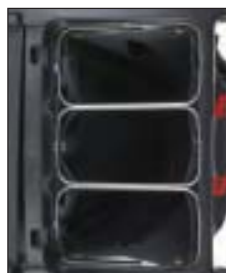
9T89 Triple Waste Wire Bag Holders

Dim 12 \frac{1}{2} " l x 3" w x \frac{1}{8} " h Ship Wt 3.5 lbs Color 0000 Pack 1 set