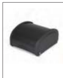
9T86 Locking Security Hood

Dim 9 \frac{1}{2} " l x 17" w x 19" h Ship Wt 8 lbs Color BLA Pack 1