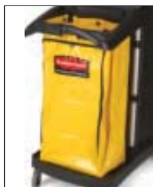
9T80 High Capacity Vinyl Replacement Bag

Dim 33" l x 10 \frac{1}{2} " w x 17 \frac{1}{2} " h Ship Wt 6.2 lbs Color YEL Pack 2