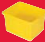
30 Quart Storage Bins