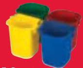
5 Quart Disinfecting Pails