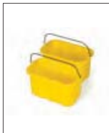
9T82 10 Quart Disinfecting Caddy

Dim 7 \frac{1}{2} " l x 14" w x 8" h Ship Wt 10 lbs Color YEL, BLA Pack 6