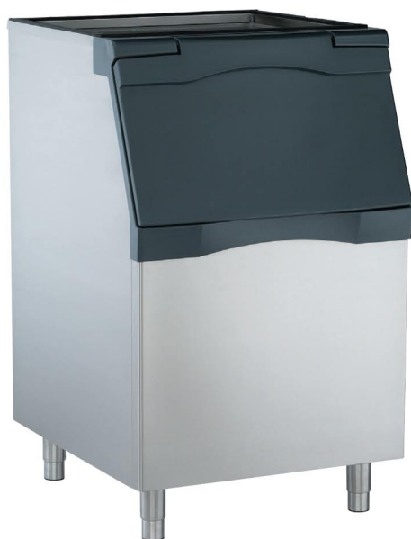
B530S shown with optional KLP8S legs