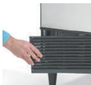
Front Air Filter