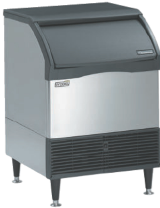
CU1526 / CU2026