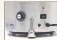
Controls and Fuse Housing at rear for discreetness