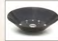
Unique Heat Shield for longevity of the Motor