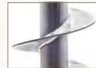
Double welded Auger Flights for sanitation approval