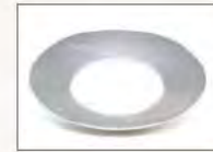
Widest Heating Element for melting solid chocolate. No more pre-melting!