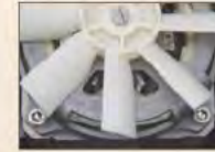
Motor rated for over 10,000 hours of use with 2 year warranty against manufacture defect