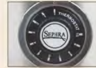
Analog Temperature Control for durability