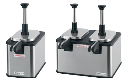
EZT-S & EZT short models

Models accommodate large and small operations, serving 1 or 2 toppings with or without the ability to pre-heat a reserve pouch; single unit also available without spout heater.