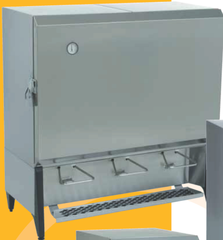
Model SK18 MAJ