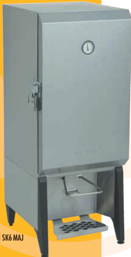
Model SK6 MAJ