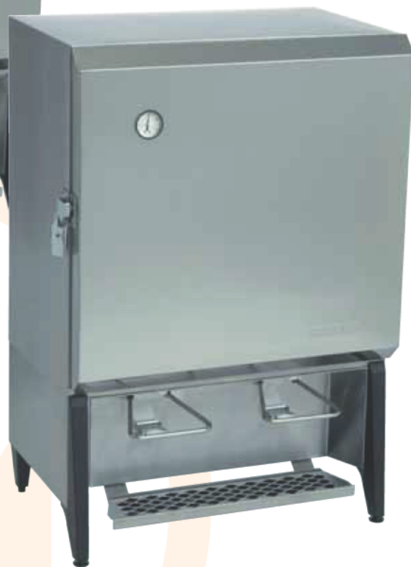
Model SK12 MAJ