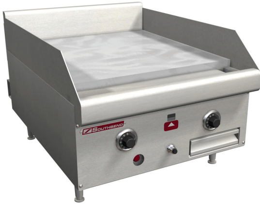
Model shown Model HDG-24