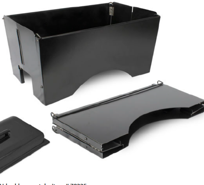
Lid sold separately; item # 70225

Introducing the Chalkboard Chafer , the latest addition to our Windguard Fold Away chafer line. Featuring a black matte finish, this unique chafer provides a blank canvas for Menu Identification, Allergy Info, Branding, etc. Plus, the Foldable Frame design makes it a snap to transport and store!