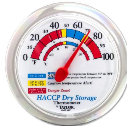
5637 Dry Storage