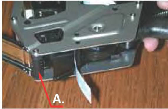
Note: When threading the labels do not pass them through the roller A.