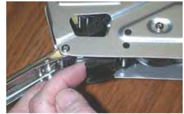
Pull down on the forward part of the printbase. This will open the path for the labels to pass through