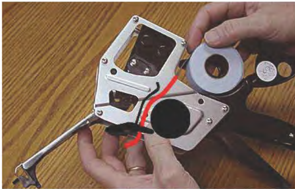
Pass labels through the label path as shown.