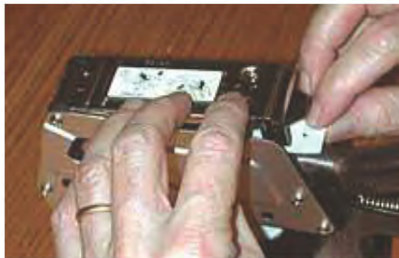
Close the bottom cover. (Label waste is dispensed between the handles.) Your price-marker is now loaded and ready for action!