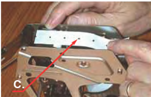
Fold labels back over and align holes in the labels with pins on the sprocket C.