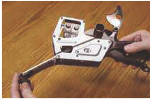
Ready to load