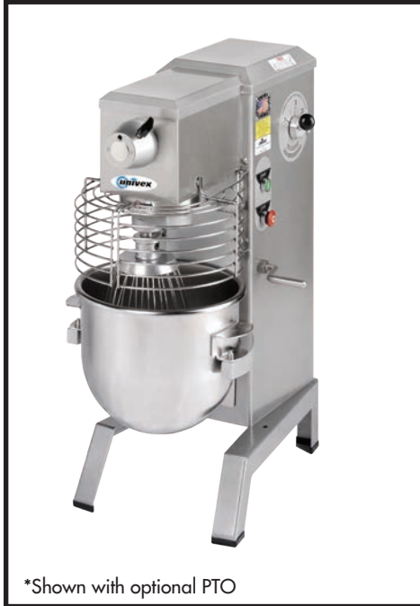
*Shown with optional PTO